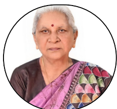
Smt. Anandiben Patel Hon'ble Chancellor & Governor of Uttar Pradesh