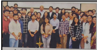
सीएसजेएमयू में आयोजित स्टार्टअप मीट में शामिल सदस्य।