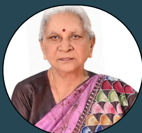
Smt. Anandiben Patel Hon'ble Chancellor & Governor of Uttar Pradesh